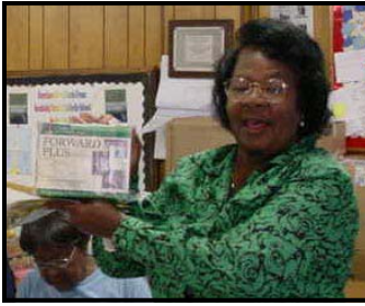
Picayune woman with vitamins donated by Healthy Directions.

The children's chewable vitamins received at Picayune were donated by Tishcon Corp and associates and were a part of the 6 million children's chewable vitamins Tishcon and friends contributed for Vitamin Relief USA's hurricane relief effort. Tens of thousands of bottles of these vitamins were also distributed through the Red Cross, Head Start programs in Mississippi as well as a network of 17 medical clinics serving hurricane victims in Houston, Texas.